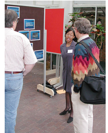
POSTERS IN THE ATRIUM